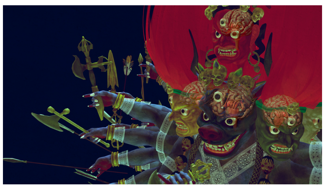
Lu Yang, Wrathful King Kong Core, 2011, project poster for video, 14'47"