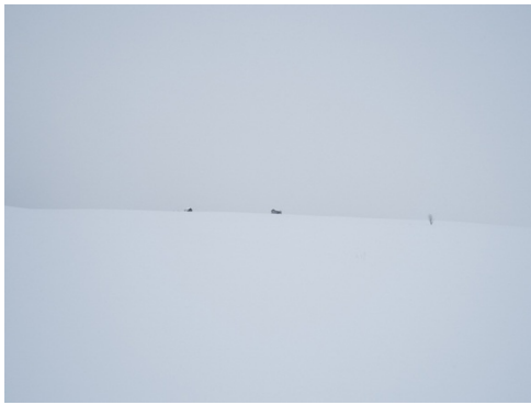
from the series of Sign-offs from Hokkaido