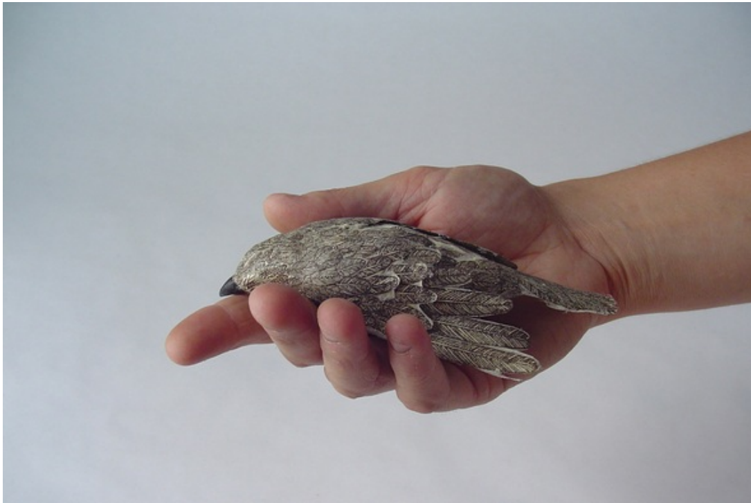
Small Dead Birds as a Unit of Measure (Failing), 2006-2008