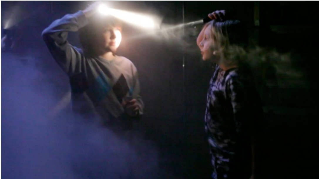
Luis Jacob, Light On (Flashlight) , 2013, video still.