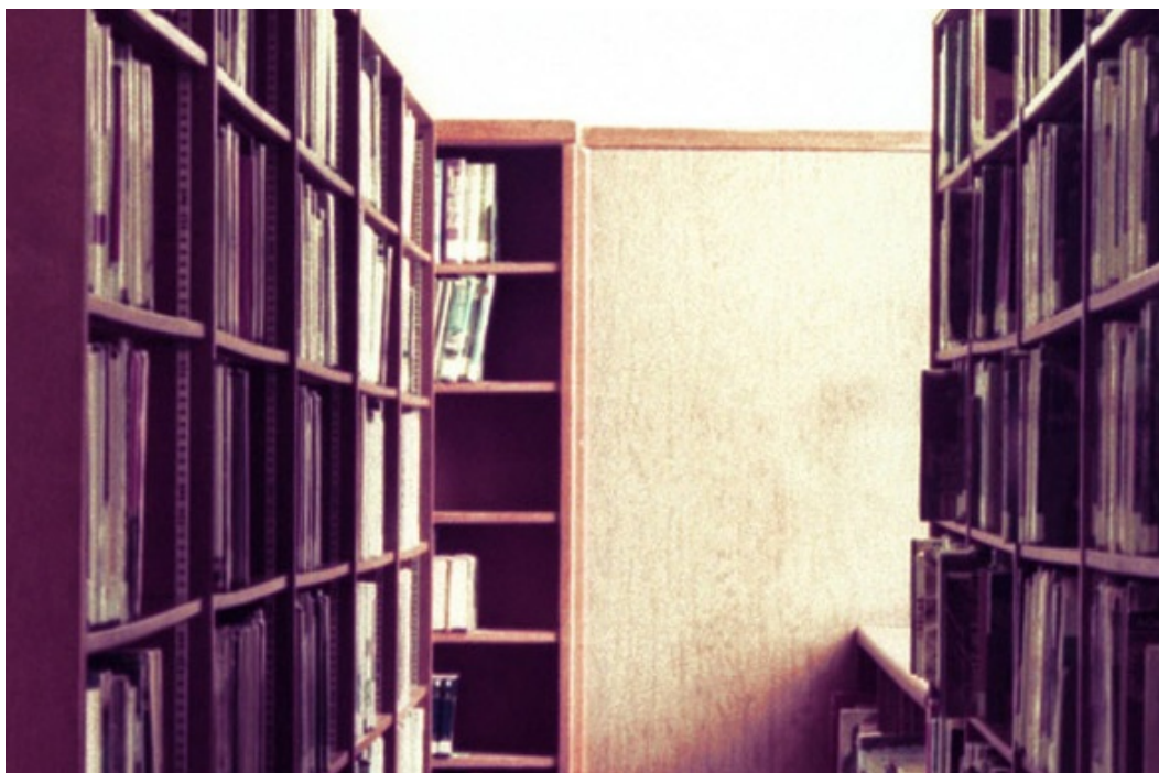
Yann Pocreau 2013 C-Print, 30 in x 40 in Construction #1 ( work in progress) * extract of the installation