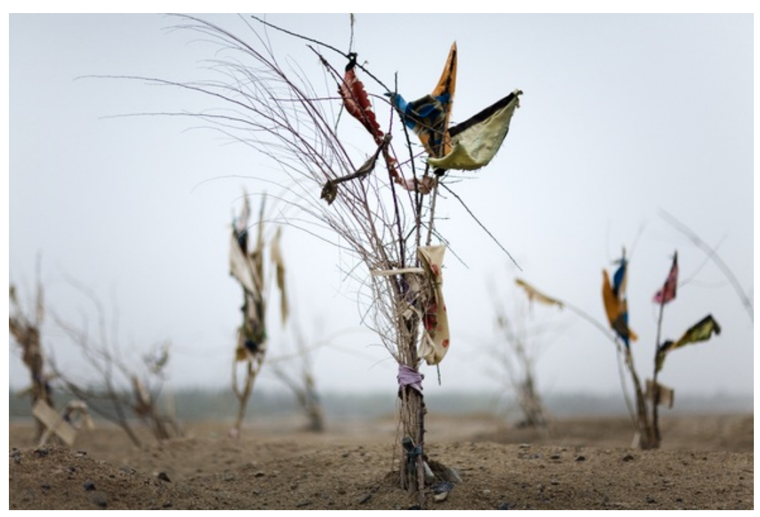
Lisa Ross, Black Garden (An Offering), archival pigment print on cotton paper, 2009.