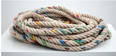
...AND JUSTICE FOR ALL! Spray colour (acryl) on cotton cloth, 22 m.